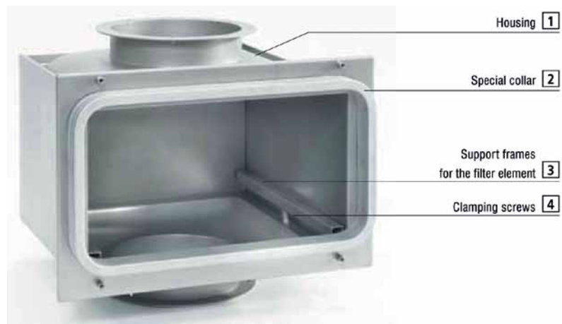
HEPA filter system, type GS, with welded flange (option on request)